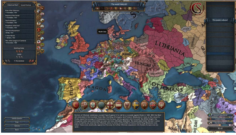
FIGURE 2: THE EUROPA UNIVERSALIS IV MAP OF EUROPE AT THE GAME'S 1444 START DATE

The standard starting date within EUIV is November 11, 1444, the day after the conclusion of the Ottoman victory at the Battle of Varna (fig. 2), and if it is played normally, the game automatically ends on 3 January 1821. The fact that EUIV ends in the time of the Napoleonic Wars (this section of the game is referred to as the Age of Revolutions) provides enough chronological distance to mitigate some of the more visceral reactions that people could have regarding more sensitive moments of global history. Even with this distance though, there are plenty of moments within the game that allow players to take part in issues such as the forced destruction and assimilation of Indigenous communities and profiting from the transatlantic slave trade, albeit in a sanitized and abstracted format (LOSITO 2023). This historical distance when playing as Ukraine allows players to avoid delicate issues such as the Soviet rule over Ukraine or examples of Ukrainian nationalist collaboration with the Nazis that could lead to more confrontational encounters.