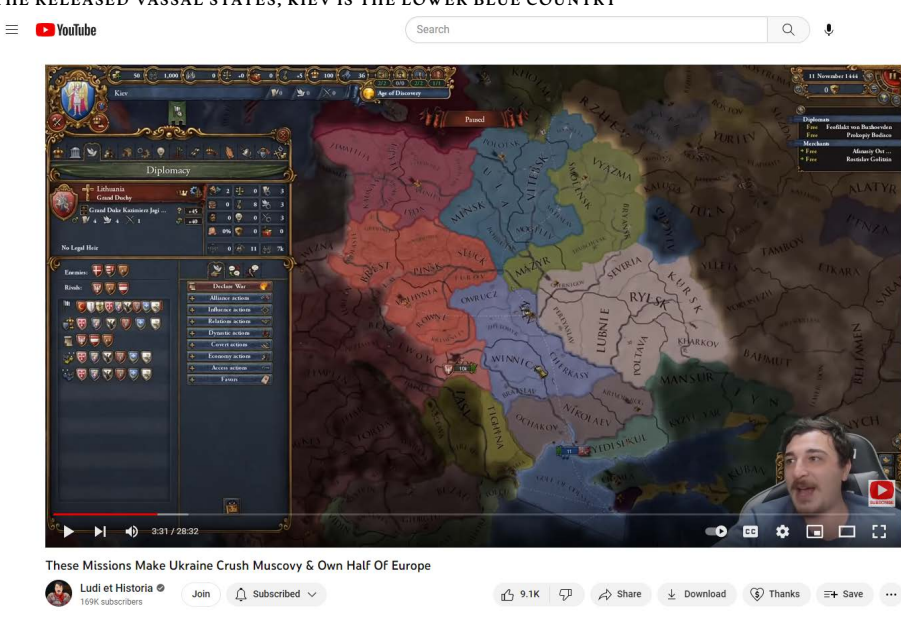
FIGURE 4: SCREENSHOT OF LUDI ET HISTORIA'S RUTHENIA CAMPAIGN SHOWING THE RELEASED VASSAL STATES; KIEV IS THE LOWER BLUE COUNTRY