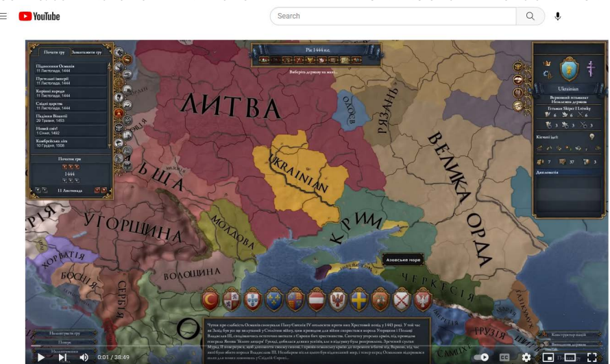
FIGURE 6: SCREENSHOT OF THE MAP OF UKRAINE AT THE BEGINNING OF SHKIPERUA'S CAMPAIGN

Shkiper's game is a bit different than the other Ruthenia and Ukraine games that I have discussed. Rather than starting as one of the Ruthenian-culture vassal states of Lithuania, he uses a game feature that allows him to create a custom nation of Ukraine, much like the mod that I mention above. His Ukraine starts out as slightly bigger than the nation of Kiev in the game and most importantly, it does not start out as a vassal state, but rather as an independent country, making it much easier for him to expand it in the earlier parts of the campaign (fig. 6).